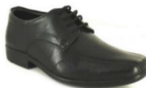
Rockstorm Jon £24