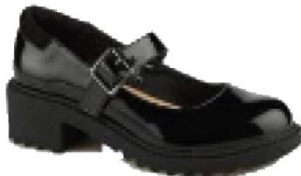
Girls Micro-Fresh Patent School Shoes £14.00