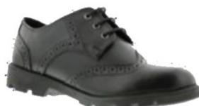
Love Leather Brodie £22