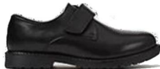
Boys Leather Chunky 1 Strap £12.00