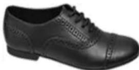
Graceland Teen Girls Lace Up £19.99