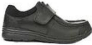
Beckett Boys Black Slip On Formal £14.99