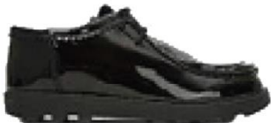
Girls Patent Lace Up School Shoes £12.00