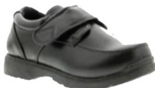
Rockstorm Albie £12