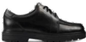
Loxham Pace Y £51.00