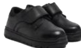
Kids' Leather Riptape Shoes £28.00 - £32.00