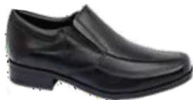
Memphis One Formal Slip On £24.99