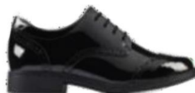
Aubrie Craft Y £50.00