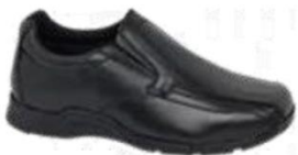
Mephis One Black Boys Slip On £19.99