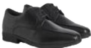
Kids' Leather School Shoes £32.00 - £36.00