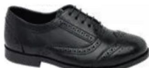
Graceland Girls Black Leather Brogue £19.99