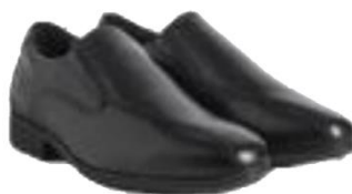
Kids' Leather Slip-On Shoes £32.00 - £36.00