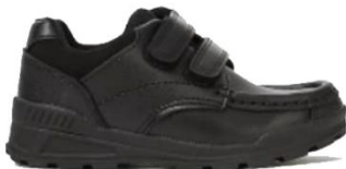
Boys Leather 2 Strap £12.00