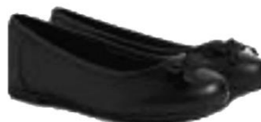
Kids' Leather Ballet Pump £24.00 - £28.00