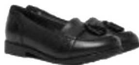
Kids' Leather Freshfeet Loafers £30.00 - £34.00