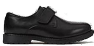
Boys Leather Chunky 1 Strap £12.00