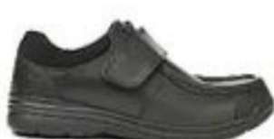
Beckett Boys Black Slip On Formal £14.99