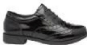
Lilley Girls Black Patent Flat Lace Up £12.99