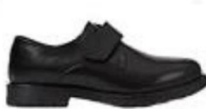
Beckett Boys Black Formal Lace Up £14.99