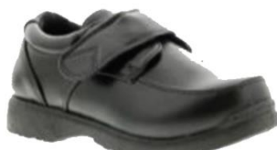
Rockstorm Albie £12