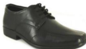
Rockstorm Jon £24