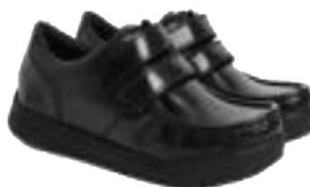
Kids' Leather Freshfeet Shoes £30.00 - £34.00