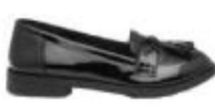
Lilley Girls Black Patent Loafer £14.99