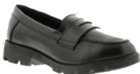
Love Leather Leana £20