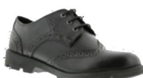
Love Leather Brodie £22