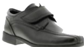
Comfisolet Percy £14