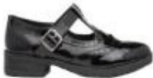
Lilley Girls Black Patent Brogue £14.99