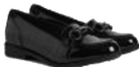
Kids' Leather Slip-On Loafers £30.00 - £34.00