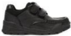
Beckett Boys Black Touch Fasten £9.99