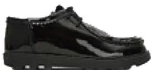
Girls Patent Lace Up School Shoes £12.00